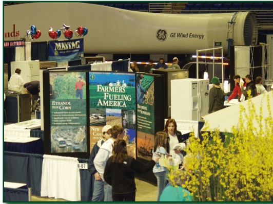
2004 Clean Energy Expo

CLEAN ENERGY EXPO. The WPPSEF organized and took a lead role in hosting a Clean Energy Expo which was held at Penn State's Bryce Jordan Center on April 2-3, 2004. The WPPSEF worked with many Expo sponsors, including all of Pennsylvania's regional sustainable energy funds, to make this Expo a reality. This Expo attracted over 11,000 attendees over the two-day event. Over 260 exhibit booths were filled, 15 free technical and community workshops were conducted, and numerous special events were held.