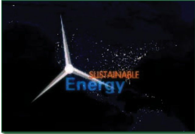
PA Energy Documentary

The West Penn Power Sustainable Energy Fund (WPPSEF) has developed a multi-faceted education program to promote the use of sustainable energy