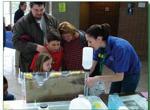
Science Lions at the Clean Energy Expo April 2-3, 2004

SCIENCE LIONS. The Science Lions is a group of undergraduate and graduate students at Penn State which volunteer their time to travel to school districts within a 50 mile radius of State College, PA to conduct in-school science demonstrations. The WPPSEF is providing support to the Science Lions to demonstrate renewable energy concepts (e.g., how solar power works). In addition, the WPPSEF is working to expand these student volunteer efforts outside of the current 50-mile radius to other universities and schools ( http://www.clubs.psu.edu/up/sciencelions ).